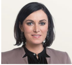
Elisabeth Köstinger Minister for Sustainability and Tourism

” It is extremely important to me that we maintain the good relationship between farming and tourism on Austria’s mountain pastures. Farmers care for our countryside and guests make an important contribution to the local economy. By setting out clear rules to keep visitors safe, we can strengthen this relationship for the future. “